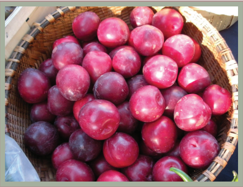
The Weare Farmer’s Market

information such as upcoming classes, conservation projects, farmers market announcements, grant funding opportunities, success stories and opportunities for agriculture in the area.