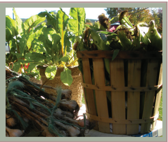
The Weare Farmer’s Market

“Just from attending one meeting I learned of a valuable resource available to me and now can possibly SAVE MY BARN with an easement.”