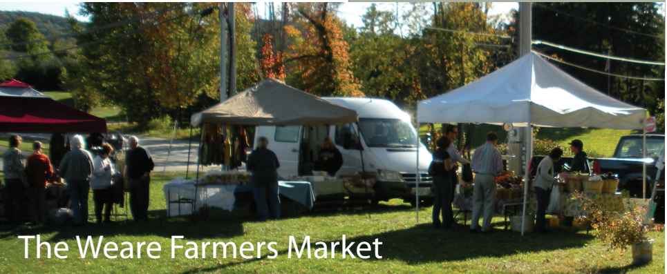
The Weare Farmers Market